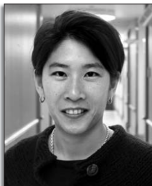
Teri W. Odom

Odom's pioneering large-area nanoscale fabrication techniques have enabled investigations on nanoscale plasmonics. Her research group focuses on optical properties of nanohole arrays in metallic films, nano-pyramids, and multilayered nanoparticles; all reveal surprising phenomena. Using near-field scanning optical microscopy, Odom has imaged how surface plasmons form standing waves between nanoholes and how these waves can be manipulated by changing the material or the wavelength of the incident light. Combining near-field, far-field, and modeling techniques to investigate large-area nanohole arrays, Odom provided direct, conclusive evidence for the role of surface plasmons in the enhanced transmission.